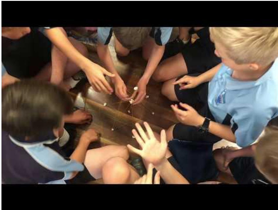
Lake Cathie Public School