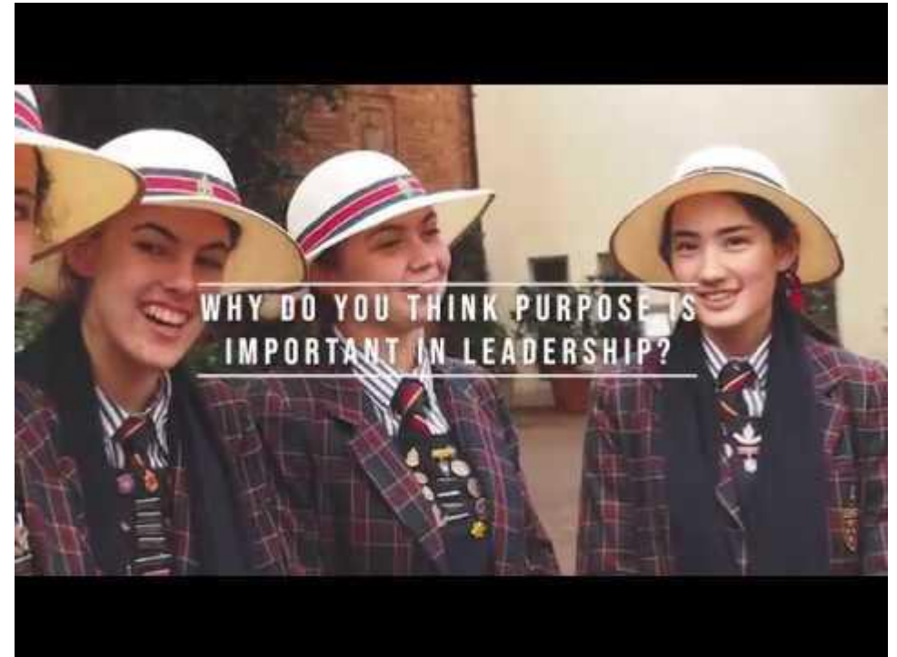
St Catherine's School Waverley